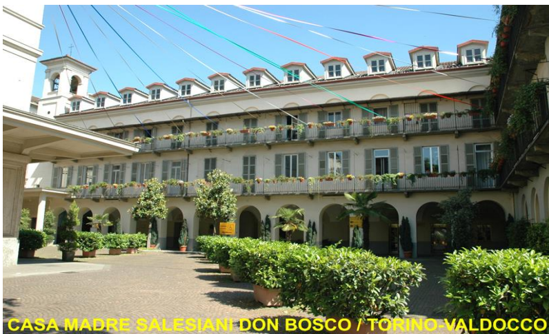
CASA MADRE SALESIANI DON BOSCO / TORINO-VALDOCCO

Is a citadel with all services, 10 minute from the Town Center of Turin, 15 minute from the station and 40 minute by bus or train to Caselle Airport.