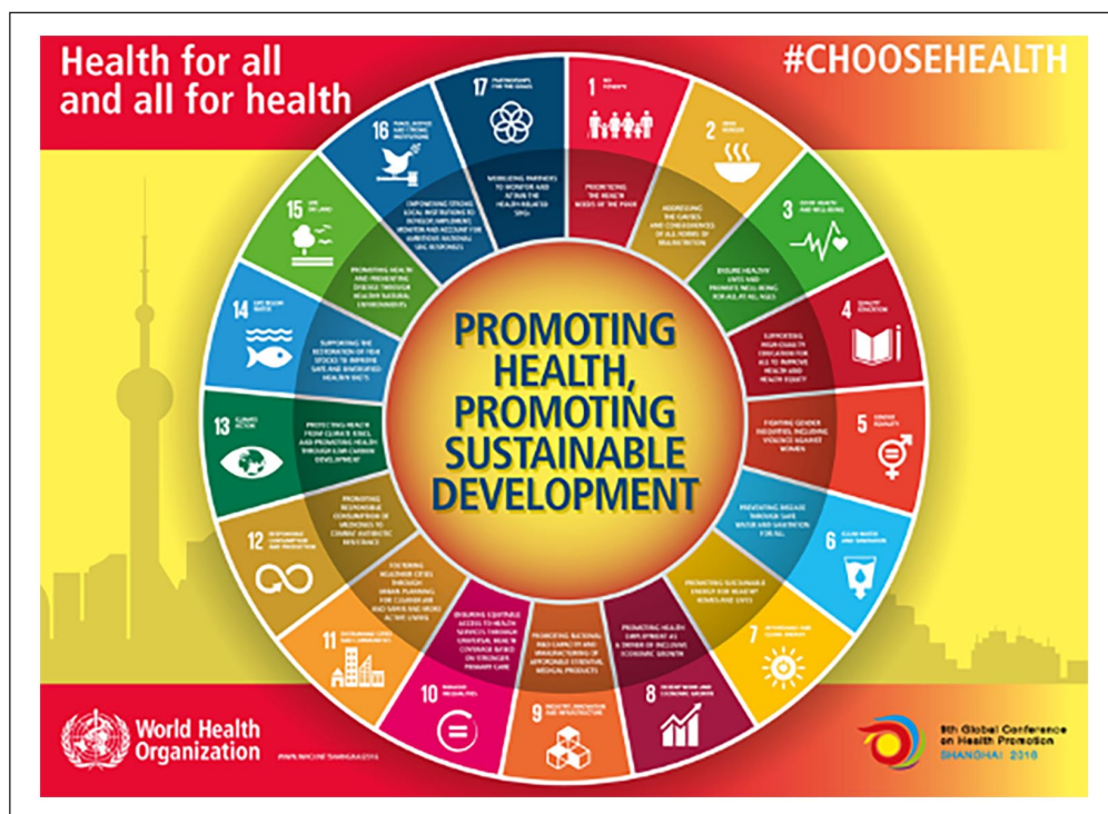
Figure 1. World Health Organization (WHO) infographic: Promoting health, promoting sustainable development.